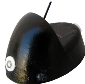
K4G 132A Sensor