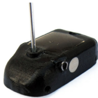
K4H 130B Sensor

Features and specifications subject to change without notice.