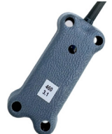
Housing (NTQB2-9-2 Only)