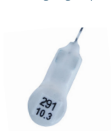
Gluemount (All Models)