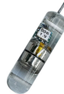
Test Tube (NTQB2-6-1 & NTQB2-6-2 Only)