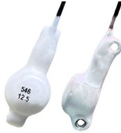
Backpack with Tubes (All Models)