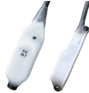
Heavy Duty Protection (All Models)