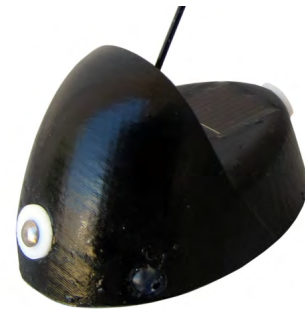
K4G 132A Sensor