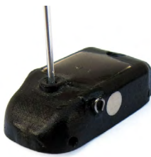
K4H 130B Sensor

Features and specifications subject to change without notice.