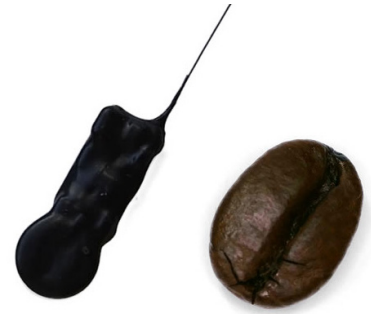
PicoPip Ag337 (coffee bean for scale)