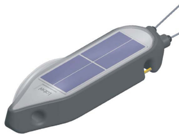
Crested dome (Diverts feathers to the side and away from the solar deck.)