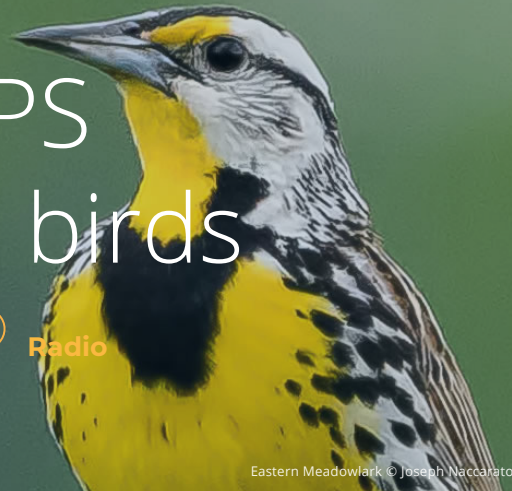
Eastern Meadowlark