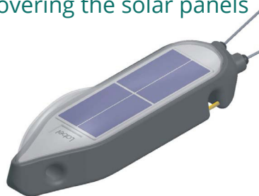
Crested dome (Diverts feathers to the side and away from the solar deck)