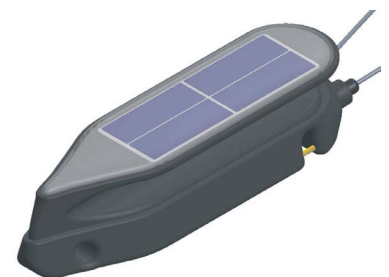
Feather channel (Channels on the sides direct feathers underneath the solar deck)