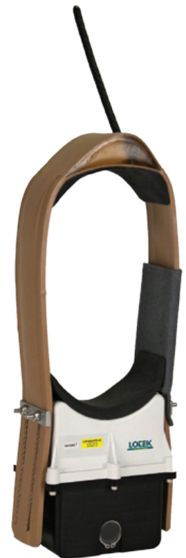
ArgosTrack M collar with video camera

**Please speak to a Lotek Representative for programming options