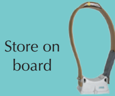
Store on board

Wildlife collars with a built-in video camera